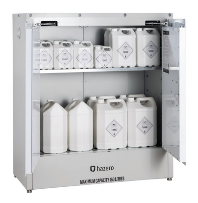
Hazero Toxic Substance Cabinet - 160L Product code 41-0604