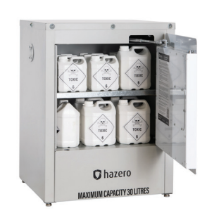
Hazero Toxic Substance Cabinet - 30L Product code 41-0601