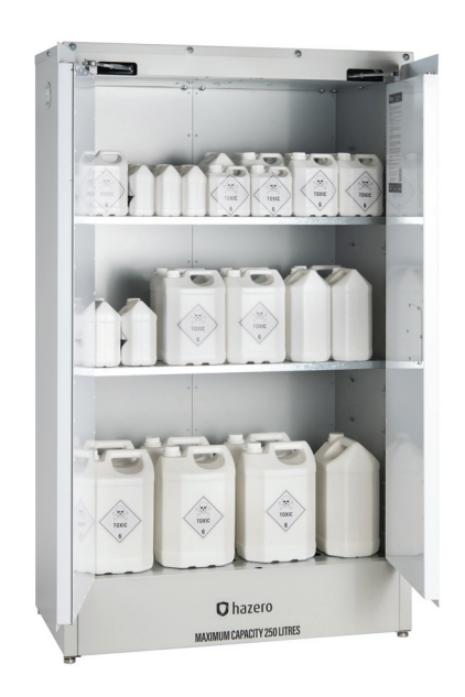
Hazero Toxic Substance Cabinet - 250L Product code 41-0605