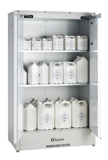
Hazero Toxic Substance Cabinet - 350L Product code 41-0606