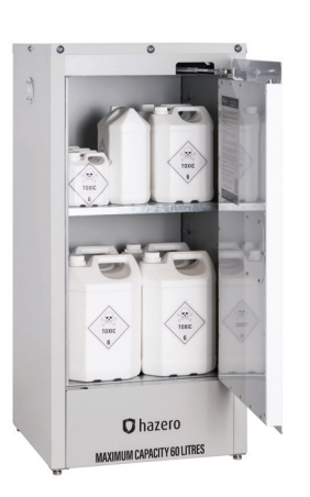
Hazero Toxic Substance Cabinet - 60L Product code 41-0602