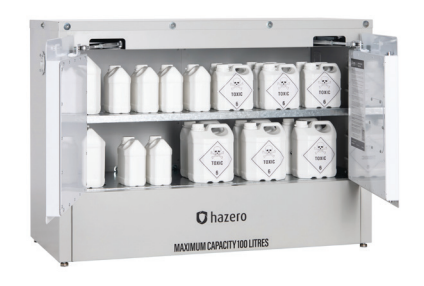
Hazero Toxic Substance Cabinet - 100L Product code 41-0603