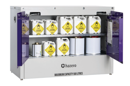
Hazero Oxidising Agent Cabinet - 100L Product code 41-0503