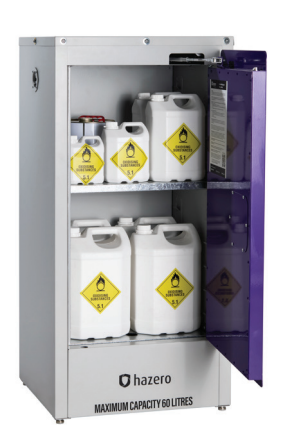
Hazero Oxidising Agent Cabinet - 60L Product code 41-0502