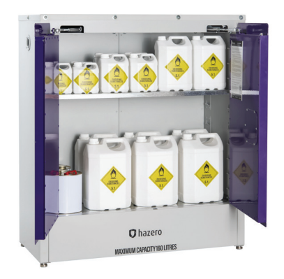
Hazero Oxidising Agent Cabinet - 160L Product code 41-0504