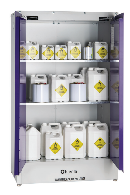
Hazero Oxidising Agent Cabinet - 250L Product code 41-0505