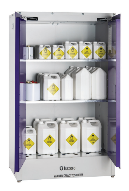
Hazero Oxidising Agent Cabinet - 350L Product code 41-0506