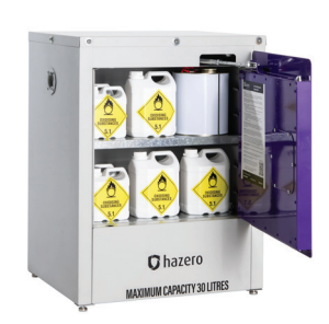
Hazero Oxidising Agent Cabinet - 30L Product code 41-0501