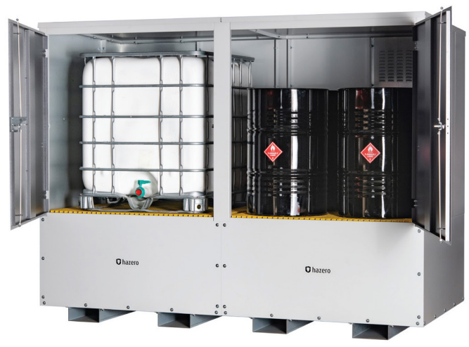
Hazero Outdoor DG Store - 8 Drum - 2 IBC Product code 41-0908