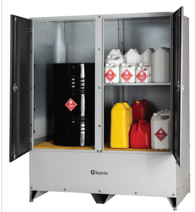
Hazero Outdoor DG Store - 500L Product code 41-0905