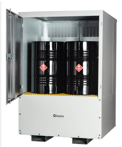
Hazero Outdoor DG Store - 4 Drum - 1 IBC Product code 41-0907