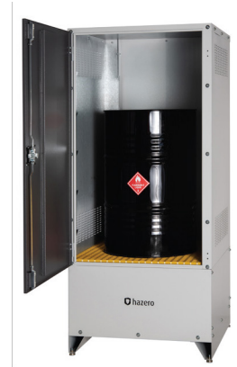
Hazero Outdoor DG Store - 250L Product code 41-0904