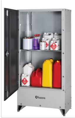
Hazero Outdoor DG Store - 160L Product code 41-0903