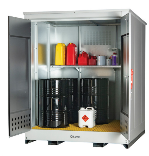
Hazero Outdoor DG Store - 1800L Product code 41-0909