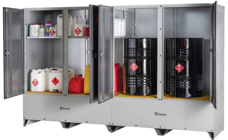
Hazero Outdoor DG Store - 1000L Product code 41-0906