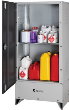
Hazero Outdoor DG Store - 160L Product code 41-0903