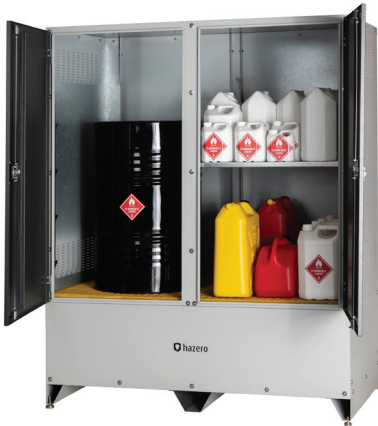
Hazero Outdoor DG Store - 500L Product code 41-0905