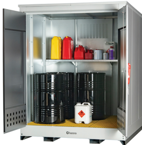
Hazero Outdoor DG Store - 1800L