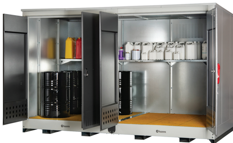
Hazero Outdoor DG Store - 3600L