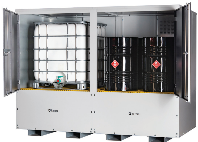
Hazero Outdoor DG Store - 8 Drum - 2 IBC Product code 41-0908