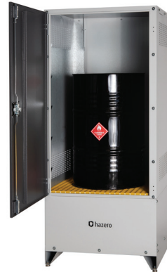
Hazero Outdoor DG Store - 250L Product code 41-0904