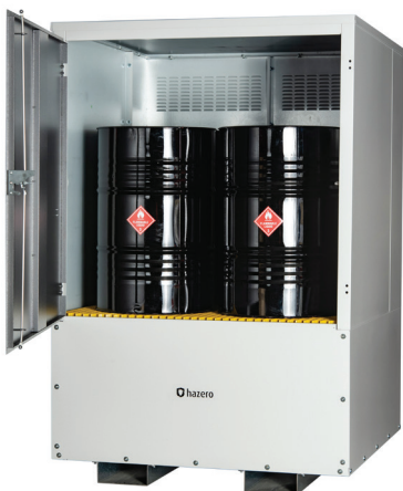
Hazero Outdoor DG Store - 4 Drum - 1 IBC Product code 41-0907