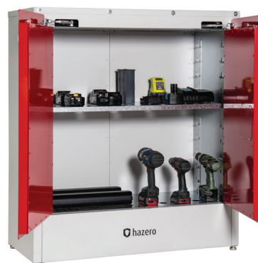
Hazero Lithium-ion Battery Safety Cabinet - Medium Product code 41-0104