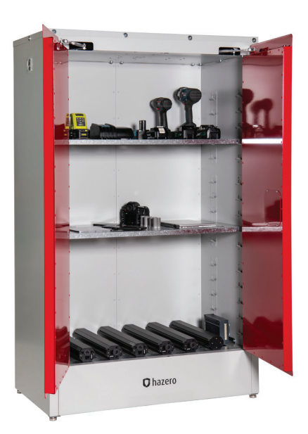
Hazero Lithium-ion Battery Safety Cabinet - Extra large Product code 41-0106

Hazero Lithium-ion Battery Safety Cabinet - Medium Product code 41-0104