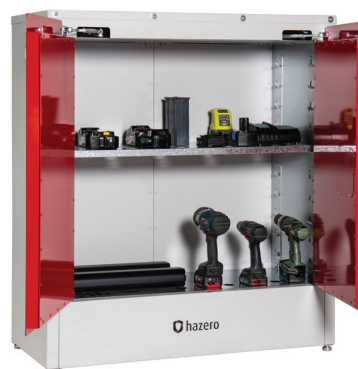
Hazero Lithium-ion Battery Safety Cabinet - Medium Product code 41-0104