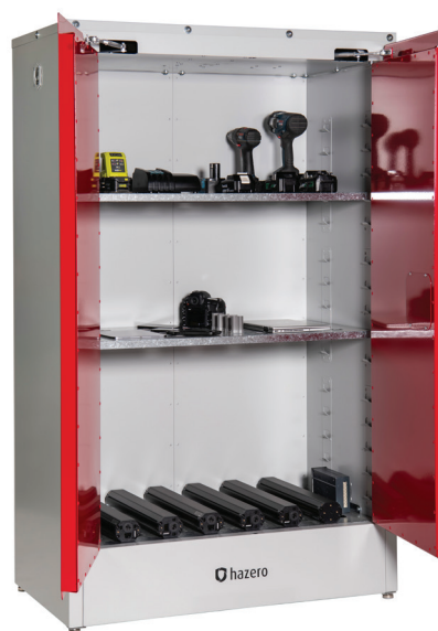
Hazero Lithium-ion Battery Safety Cabinet - Extra large Product code 41-0106