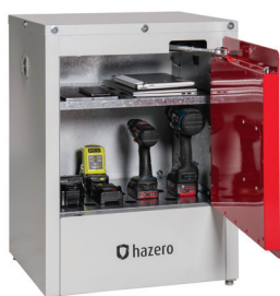
Hazero Lithium-ion Battery Safety Cabinet - Mini Product code 41-0101