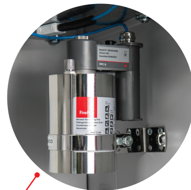
Hazero 240v Ventilation, Alarm System & Cut-off for Lithium-ion Battery Safety Cabinet