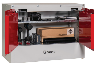
Hazero Lithium-ion Battery Safety Cabinet - Standard Product code 41-0103