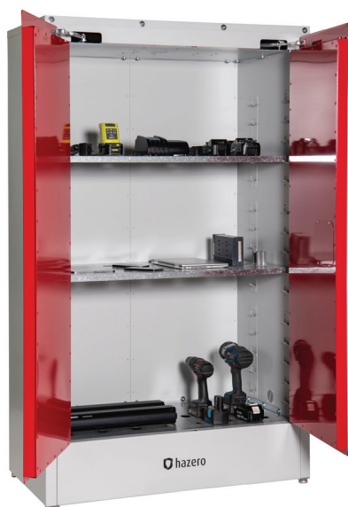
Hazero Lithium-ion Battery Safety Cabinet - Large Product code 41-0105