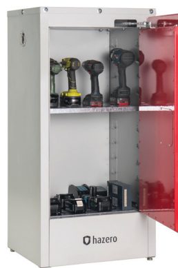
Hazero Lithium-ion Battery Safety Cabinet - Compact Product code 41-0102