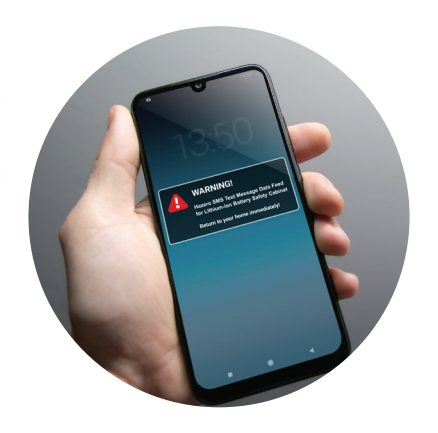
Hazero SMS Text Message Data Feed for Lithium-ion Battery Safety Cabinet Product code 41-0013

Small - Product code 41- 0014 Medium - Product code 41-0015 Large - Product code 41-0016