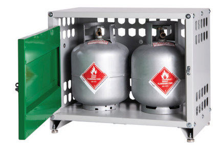
Hazero Gas Cylinder Store - Extra Small Product code 41-0207