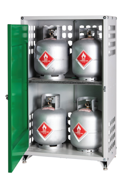
Hazero Gas Cylinder Store - Small Product code 41-0208