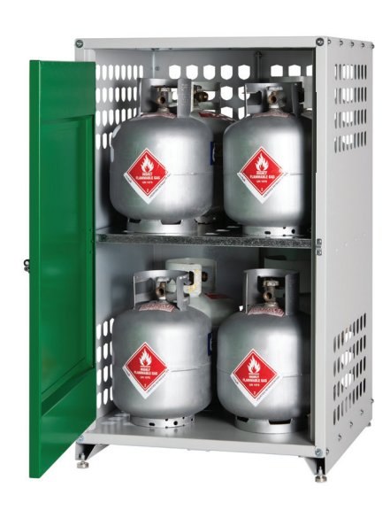
Hazero Gas Cylinder Store - Medium Product code 41-0209