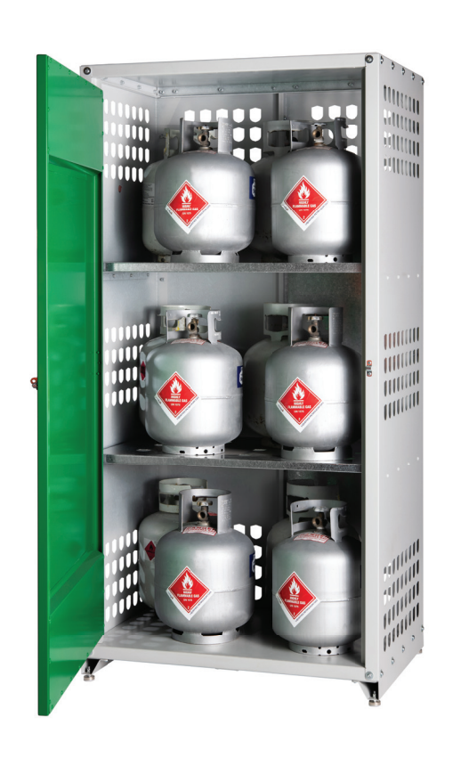
Hazero Gas Cylinder Store - Large Product code 41-0210