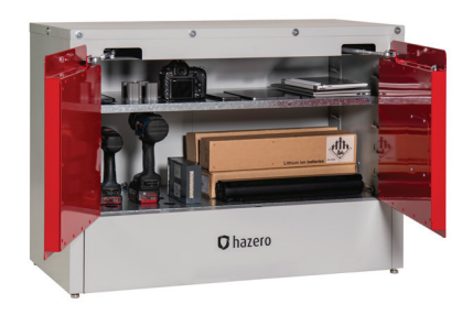
Hazero Lithium-ion Battery Safety Cabinet - Standard Product code 41-0103