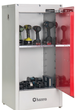
Hazero Lithium-ion Battery Safety Cabinet - Compact Product code 41-0102