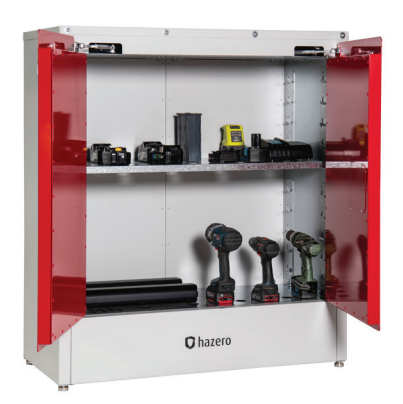
Hazero Lithium-ion Battery Safety Cabinet - Medium Product code 41-0104