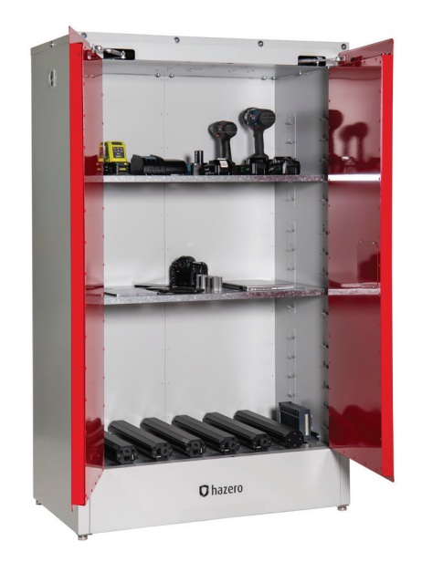
Hazero Lithium-ion Battery Safety Cabinet - Extra large Product code 41-0106