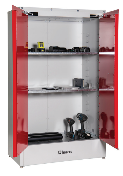
Hazero Lithium-ion Battery Safety Cabinet - Large Product code 41-0105