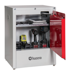
Hazero Lithium-ion Battery Safety Cabinet - Mini Product code 41-0101